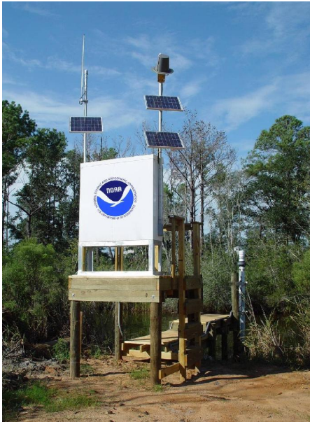
Tidal datum station, Weeks Bay Reserve